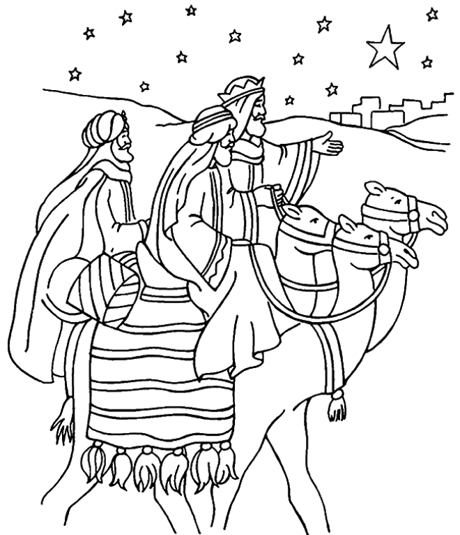
Colour the Three Wise Men